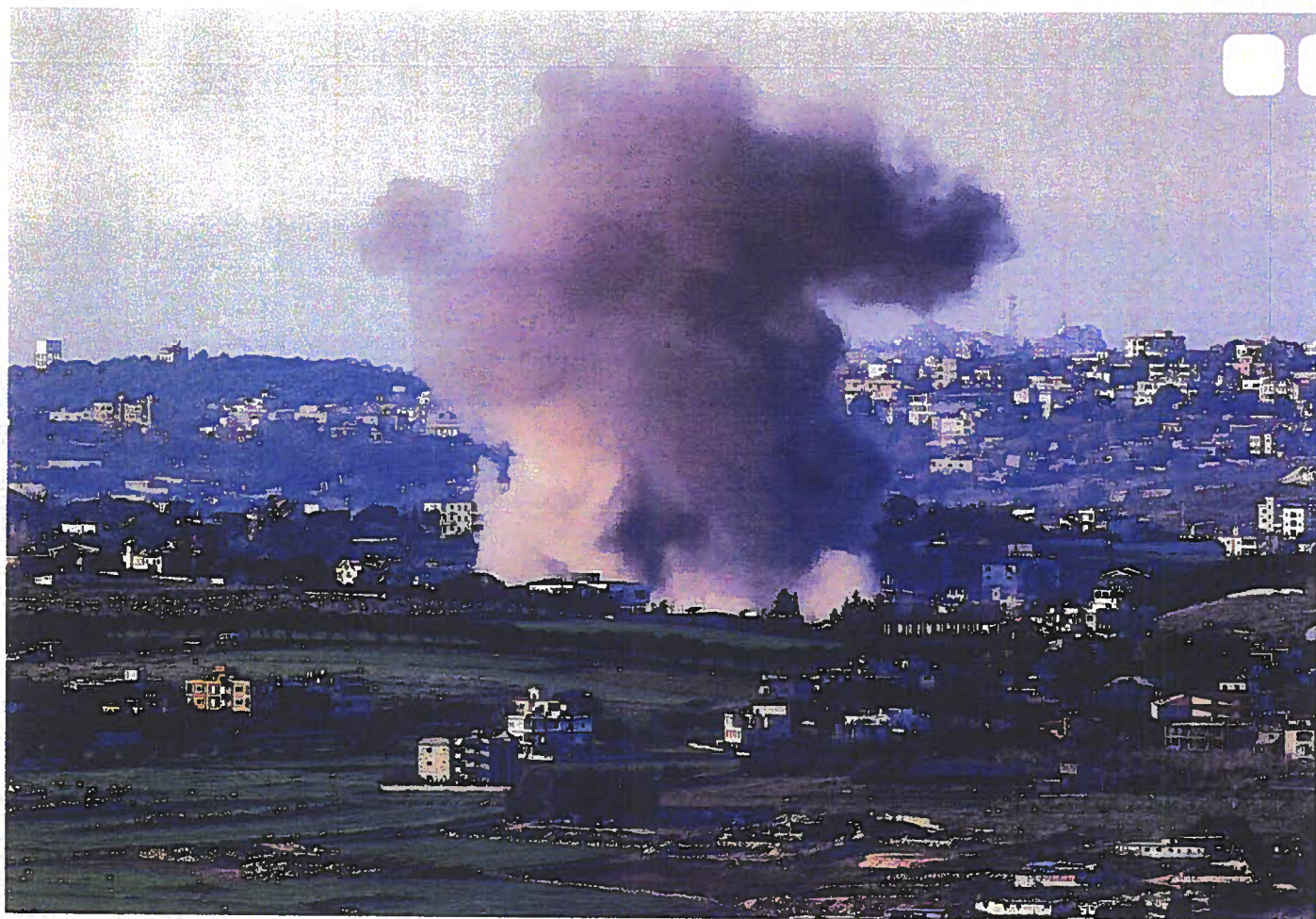
Smoke rises from an explosion following Israeli bombardment on southern Lebanon near the border with northern Israel on March 2, 2026.

(Republished from The Grayzone by permission of author or representative)